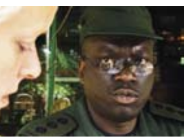
e Soldier's Footsteps