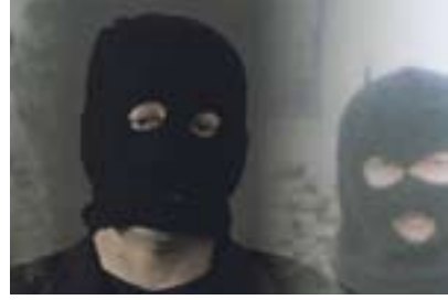
he Anatomy of Evil