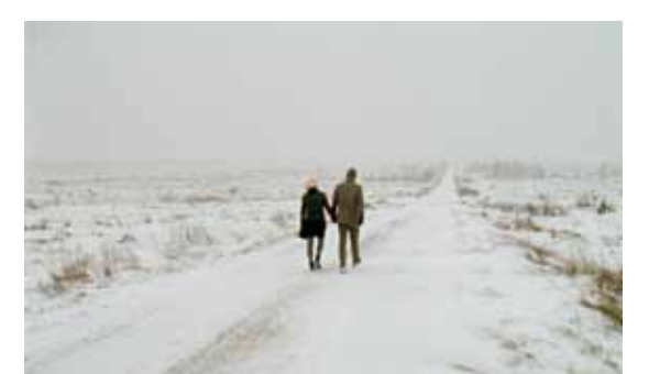
Out of Bounds

"I love human absurdities, when people look silly or goofy. I'm not so much into slickness or perfection. I never aim for that."