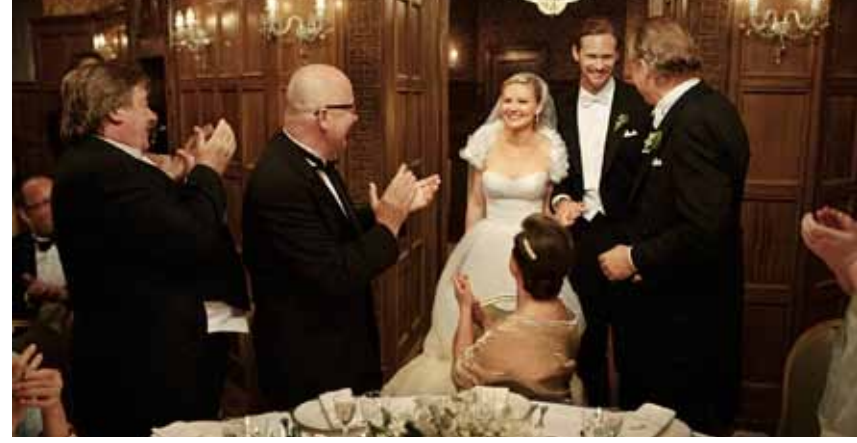
Melancholia

"They showed me a mock-up of a poster and some stills and a trailer for Melancholia, and I went, 'I don't know this film.' 'But this is the one you made.' 'I certainly hope not,' I said."