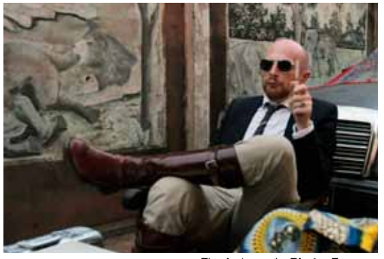
The Ambassador

"The role of the diplomat is a lot like that of a journalist. They both have to go see everybody, talk to everybody. Only, diplomats can operate far beyond any ethical boundaries and still remain respected members of society."