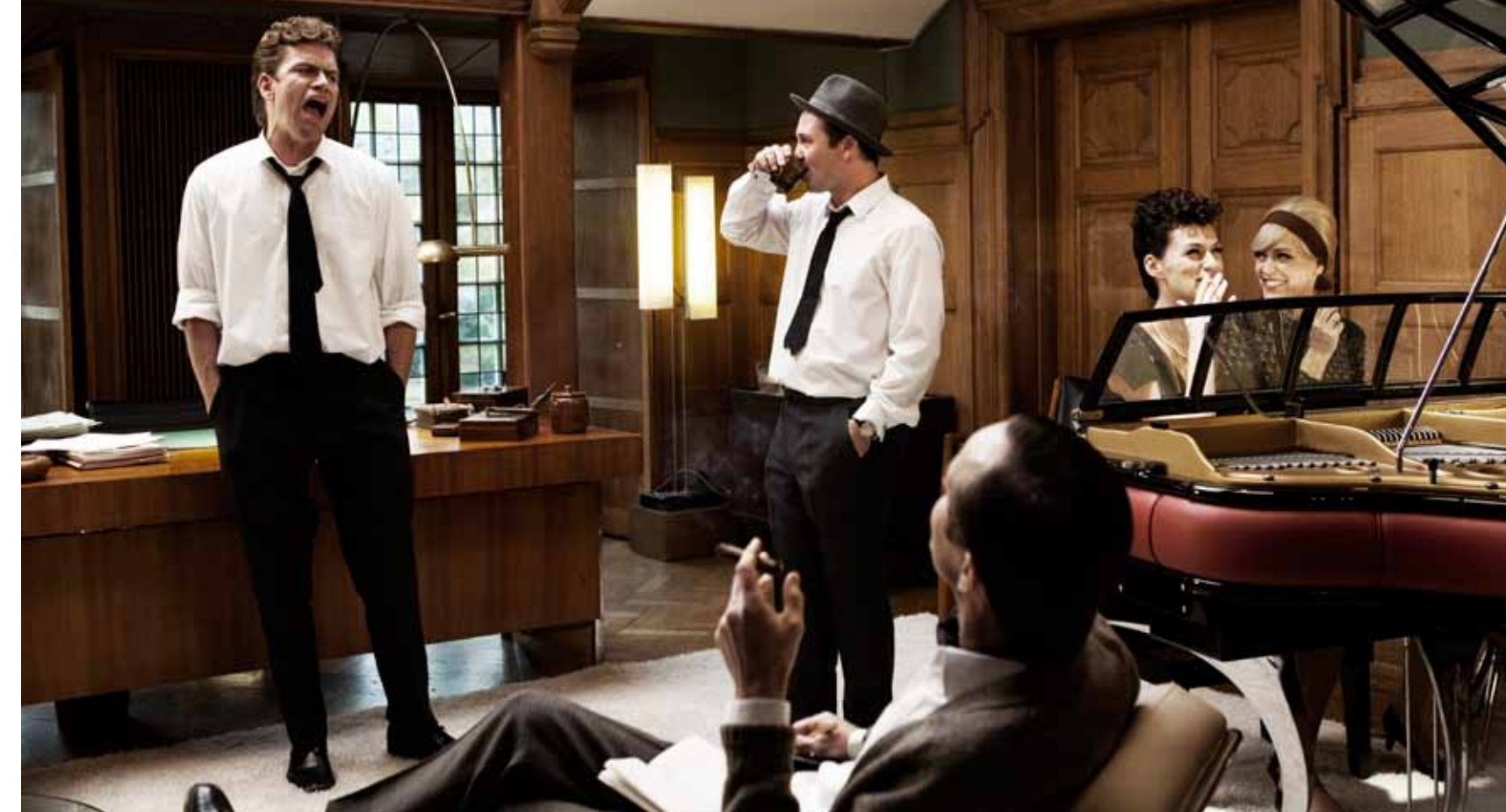
A Funny Man