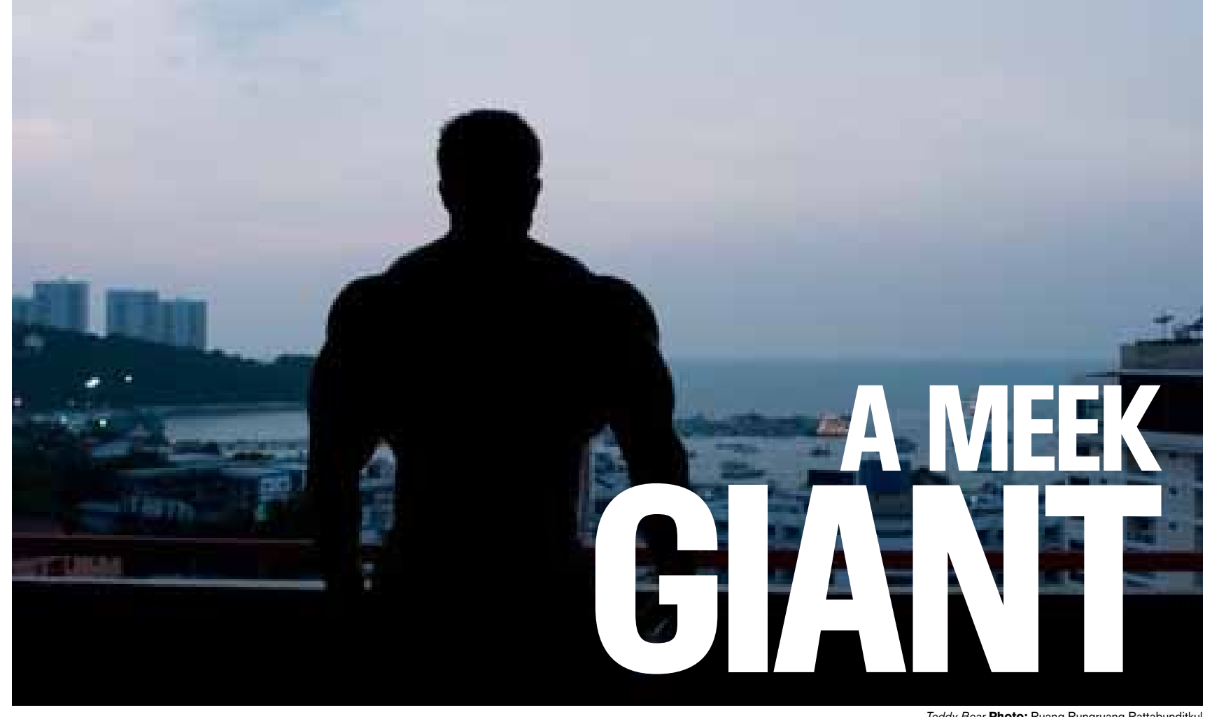
Teddy Bear