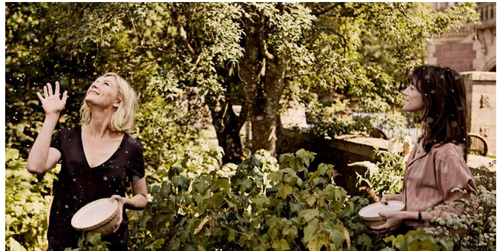
Melancholia

Melancholia to be about the end of the world and the human race but about humans acting and reacting under pressure. The idea for the film emerged while he was in treatment for the depression that has haunted him in recent years. A therapist told him a theory that depressives and melancholics act more calmly in violent situations, while "ordinary, happy" people are more apt to panic. Melancholics are ready for it. They already know everything is going to hell.