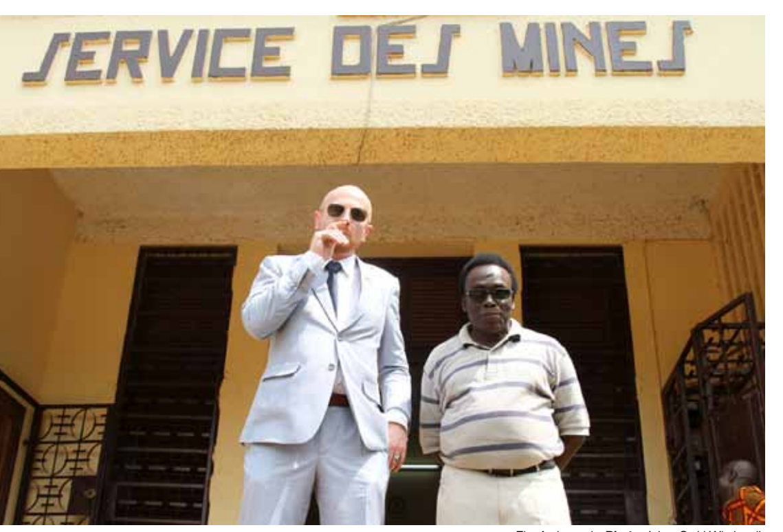
The Ambassador

"That seemed like a good jumping-off point for a film about Africa stripped of NGOs, sarongs, Bono, child soldiers and kids with bloated bellies."