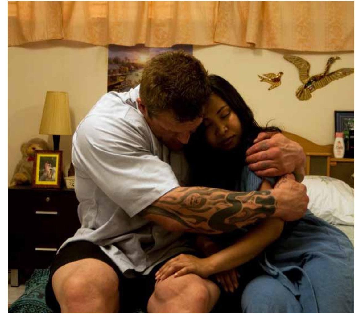
Teddy Bear