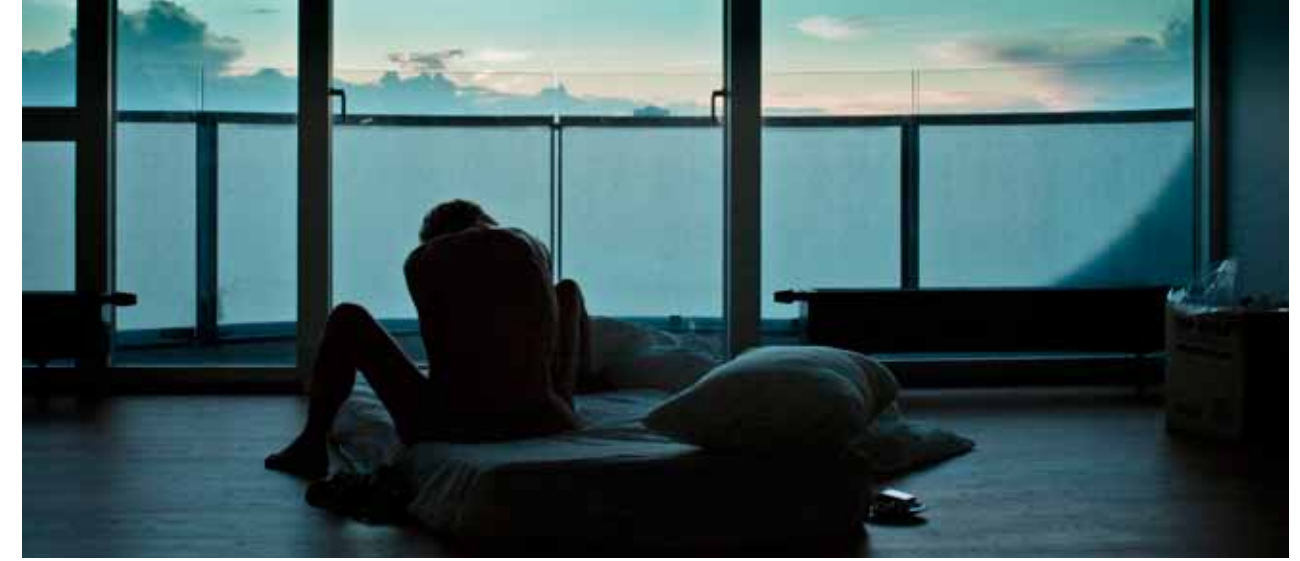
Code Blue