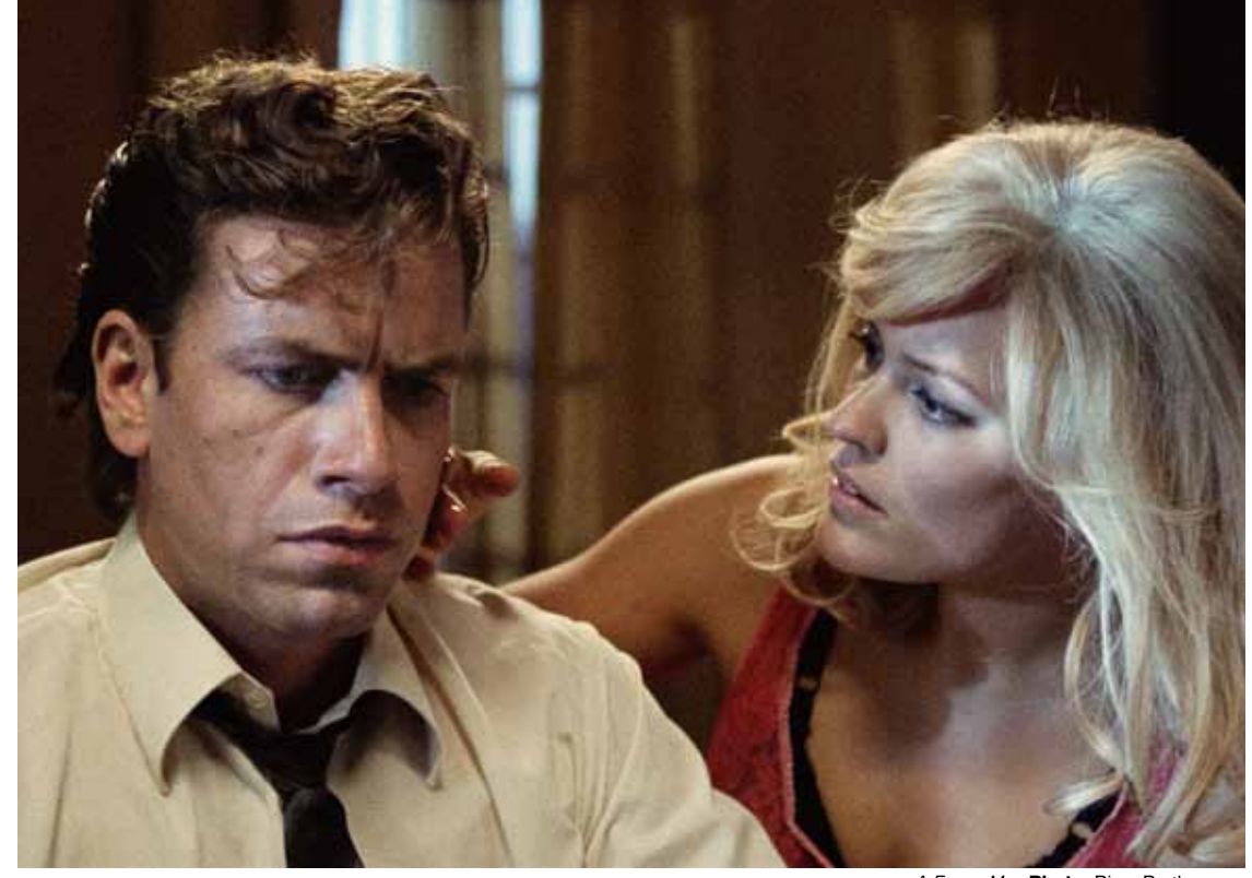
A Funny Man

For further information on A Funny Man, see reverse section.