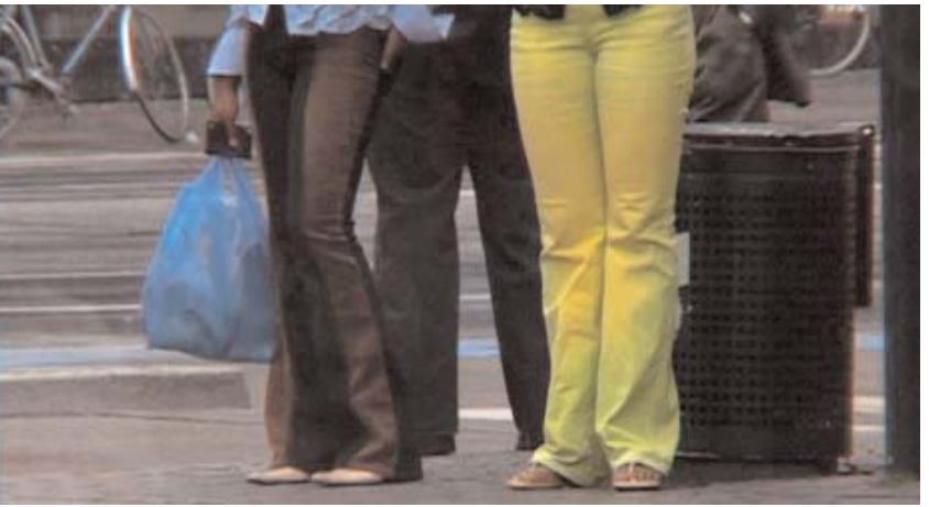
Invisible.