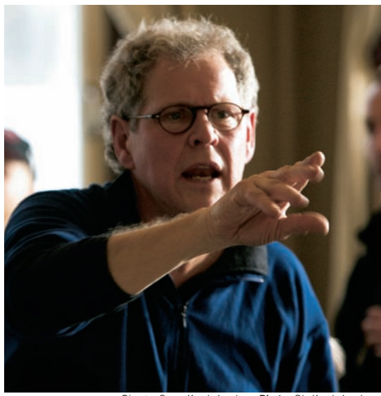
Director Søren Kragh-Jacobsen

In 1982 he made Rubber Tarzan , which won the children's film competition in Berlin. Warm and funny, the film became a collective symbol for the ambitions of Danish children's films, which had