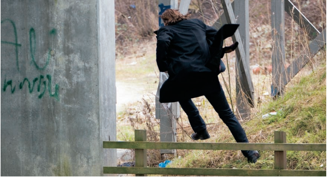
What No One Knows

Born 1947. Attended film school in Prague and worked for several years as a programme director at DR TV, the Danish Broadcasting Corporation. He first came to the world's attention at the Berlin Film Festival in 1982, when he won a best children's film award for Rubber Tarzan . He next competed in Berlin in 1997 with The Island on Bird Street . In 1999, his Dogme film Mifune won a Silver Bear and several other prestigious international awards. What No One Knows is produced by Nimbus Film.