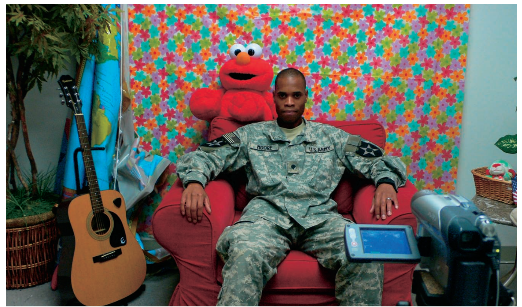
Everything Is Relative