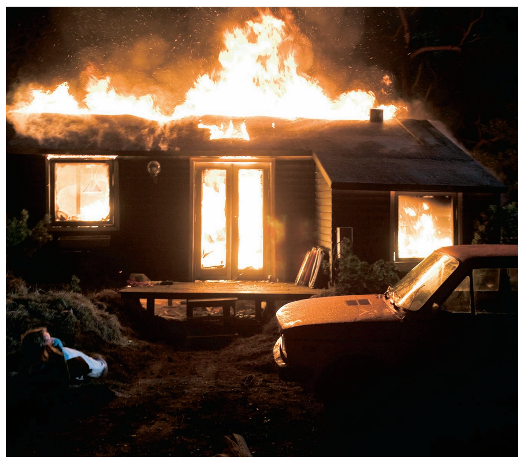
What No One Knows Photo: Ole Kragh-Jacobser